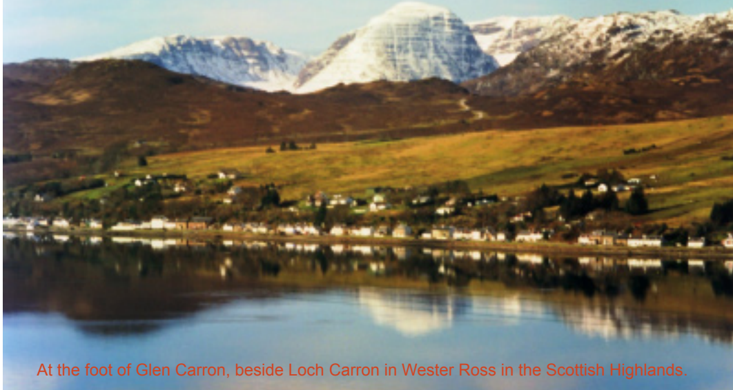
At the foot of Glen Carron, beside Loch Carron in Wester Ross in the Scottish Highlands.

There are three routes to Lochcarron by road: west from Inverness (63 miles); north from Fort William (82 miles); or south from Ullapool (102 miles via the spectacular coast road). Alternatively, you can come by train, on the world-famous line from Inverness to Kyle of Lochalsh (station at Strathcarron); or you can sail into Loch Carron from the Atlantic.